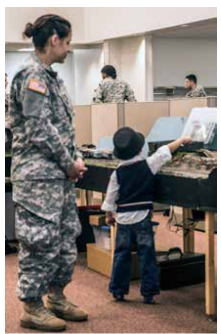
Left and below: A young man points out features to Mom, then admires a passing train.